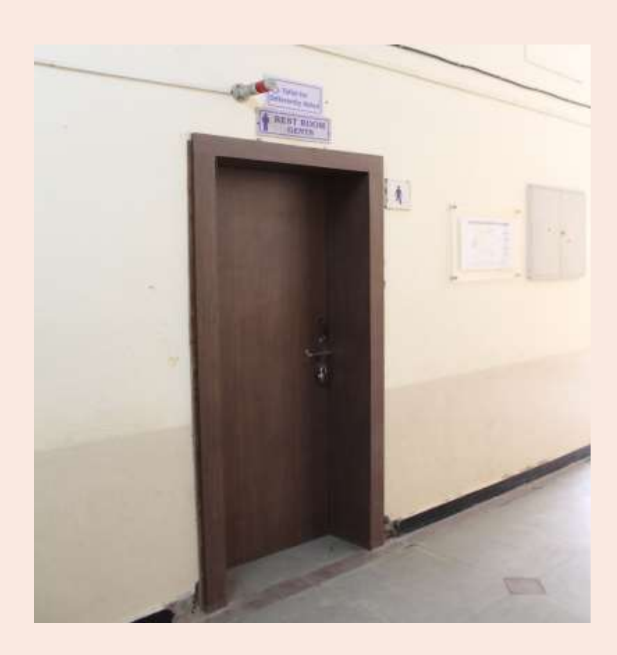
Toilets for physically challenged persons