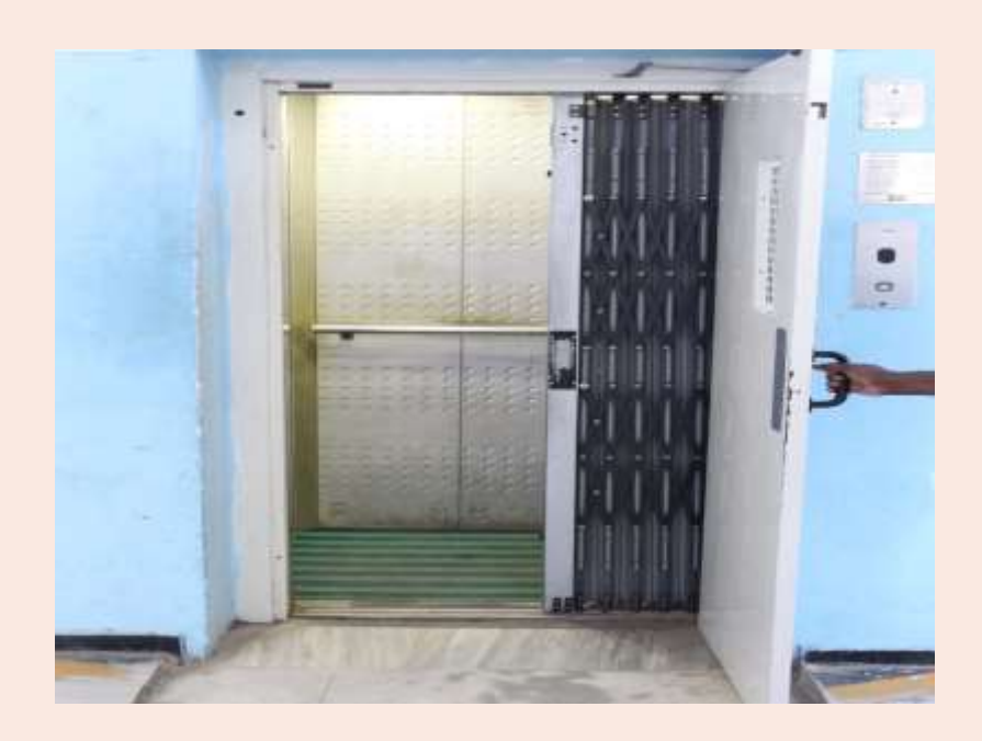
Lifts in Academic Blocks