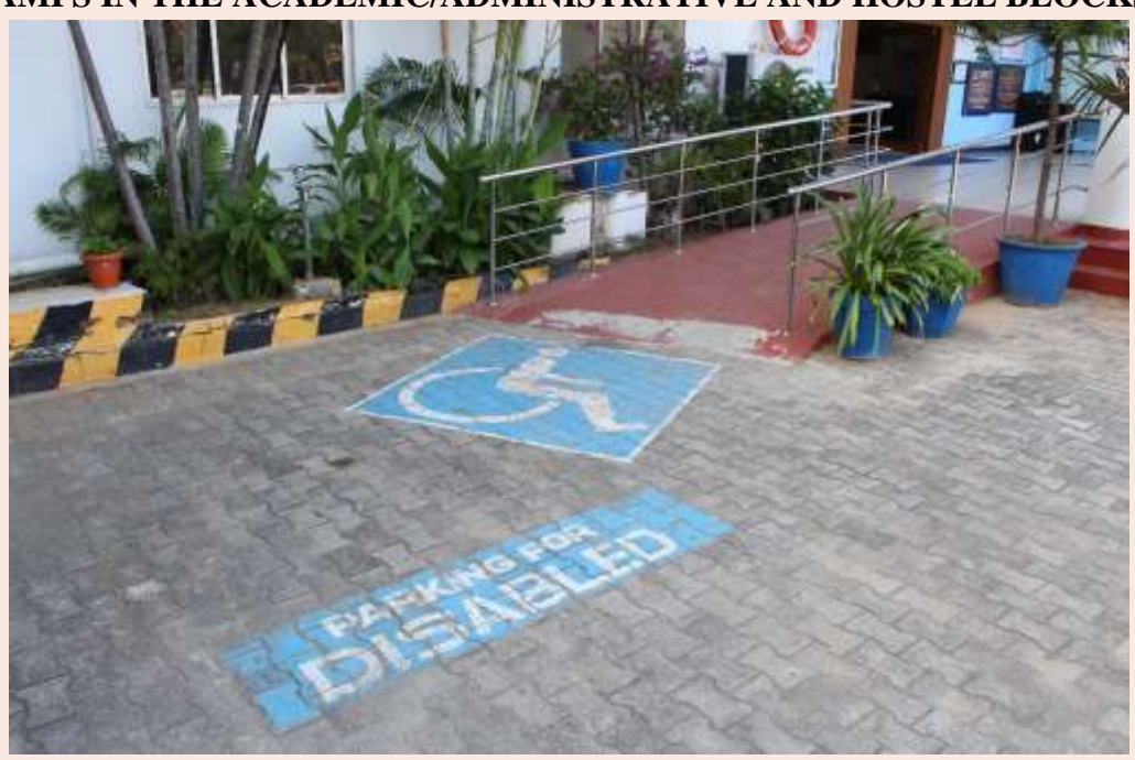
Mahatma Gandhi Block