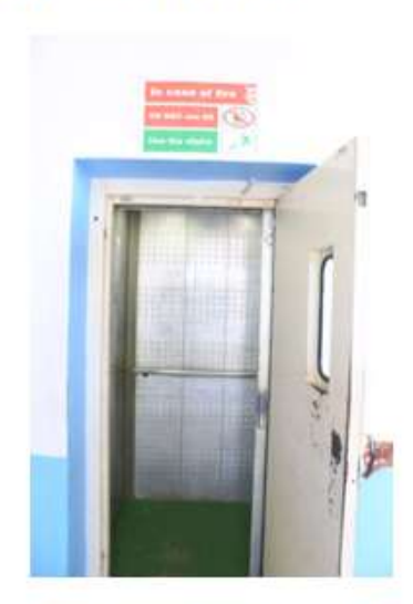
Hand rails in lifts- F Block and B Block, AMET