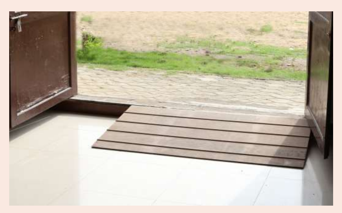
Provisions for ramps in all possible entry that could be mobilised

Seating arrangements throughout the campus (every 200 m)