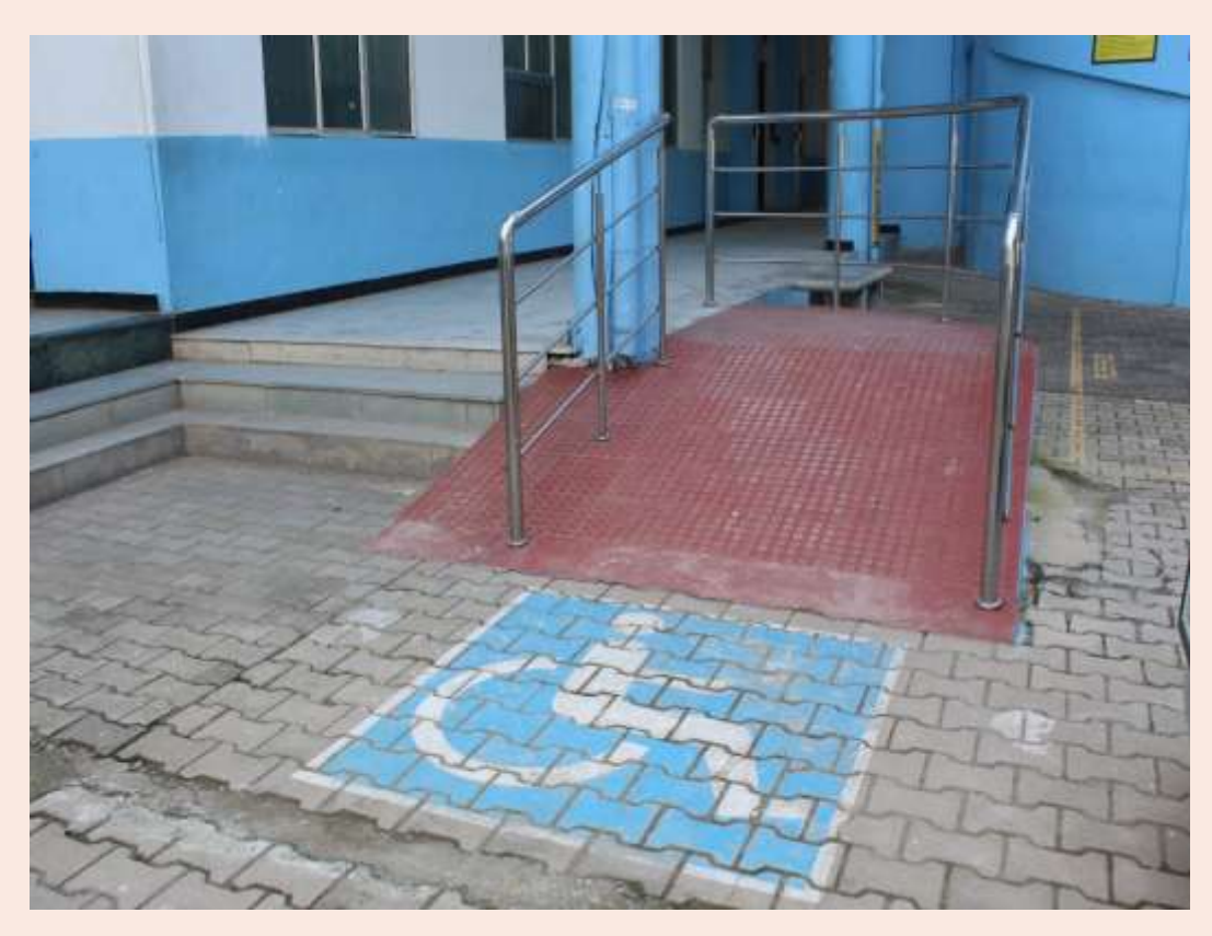
Rabindranath Tagore Block Lifts in Academic and Hostel blocks

(A de novo Category DEEMED TO BE UNIVERSITY Under Section 3 of UGC Act 1956)