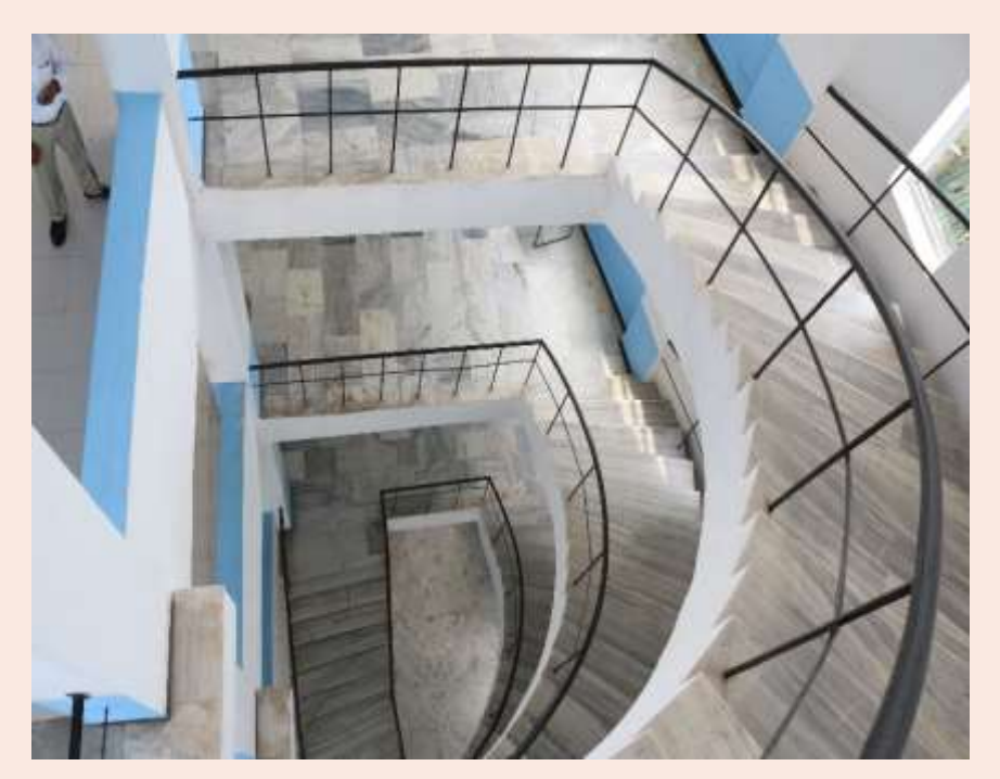
Stair Cases with hand rails