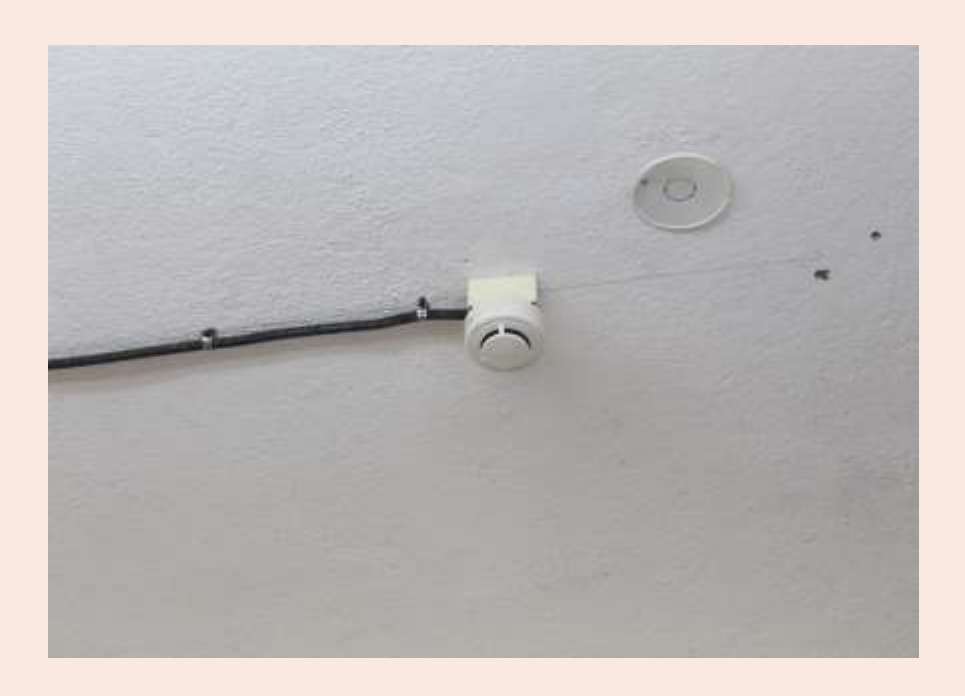
Smoke sensor present in the campus Round the clock Health Centre and Ambulance

(A de novo Category DEEMED TO BE UNIVERSITY Under Section 3 of UGC Act 1956)