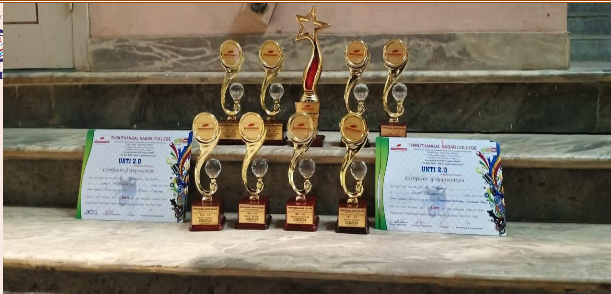
Cultural Club Won 1 st Prize in Photography, 3 rd Prize in Music & Dance at Thiruthangal Nadar Arts & Science College, Chennai on 27 th February 2020