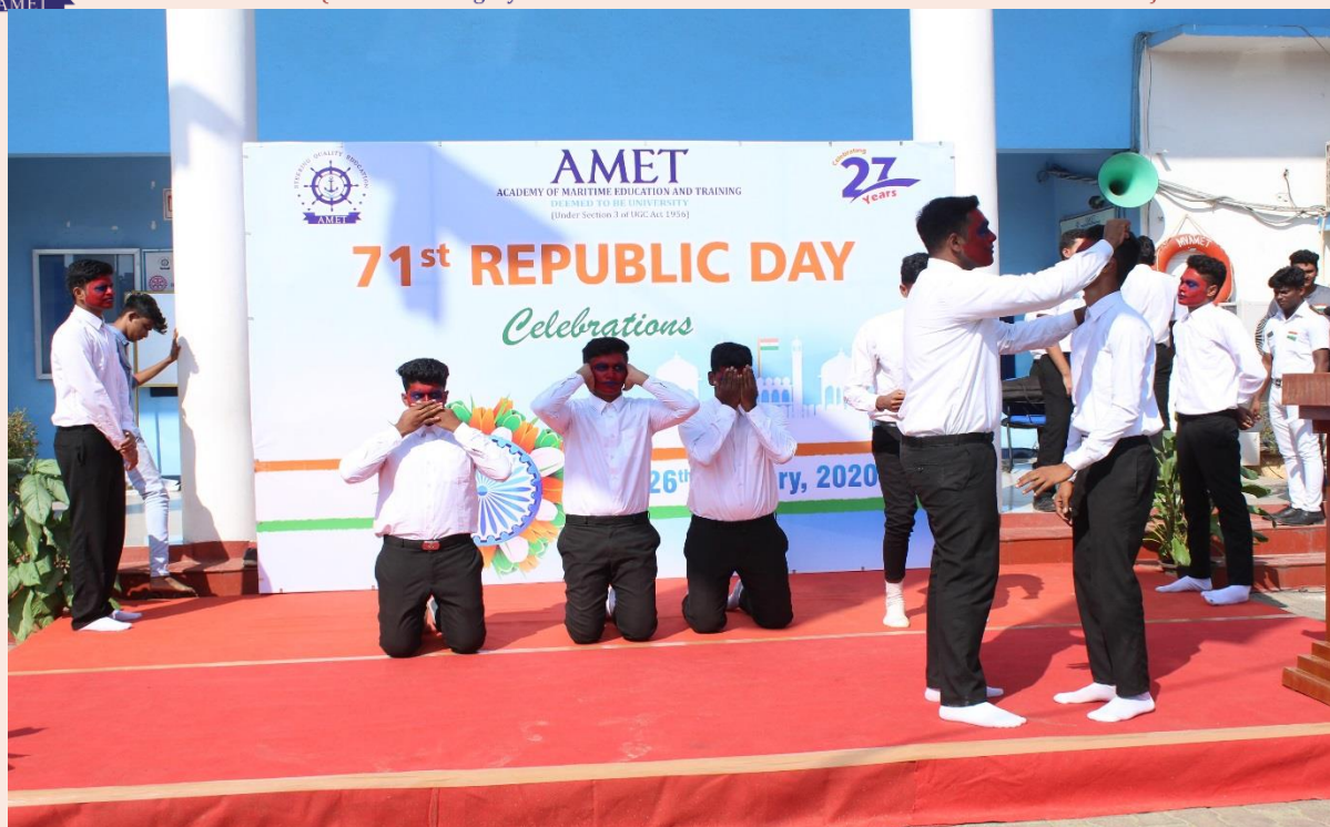
Mime performance by cultural club cadets