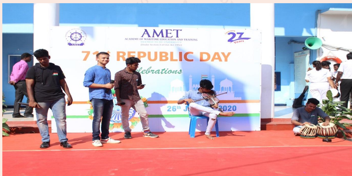
71 st Republic Day Celebration – 26 th January 2020 Singing performance by cultural club cadets