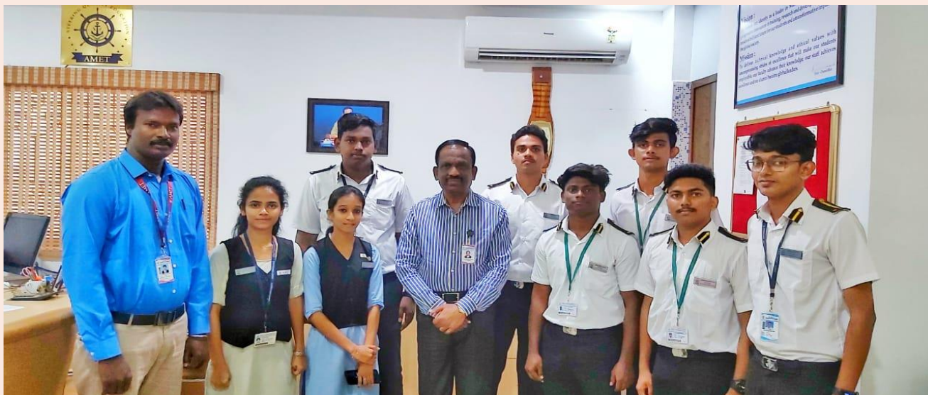
Office Bearers with Honorable Vice Chancellor