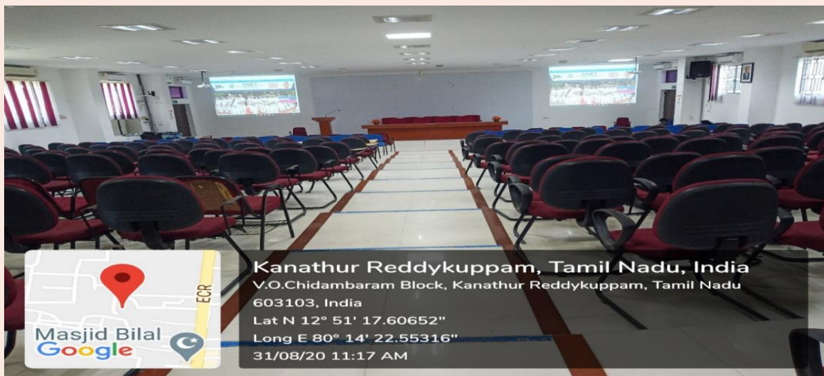
Auditorium with seating capacity 400 members