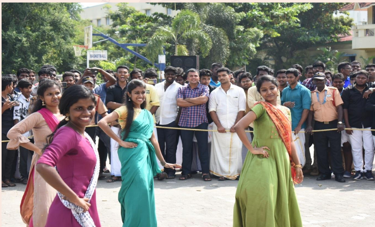
Girls Dance Performance in Pongal Celebration – 2020