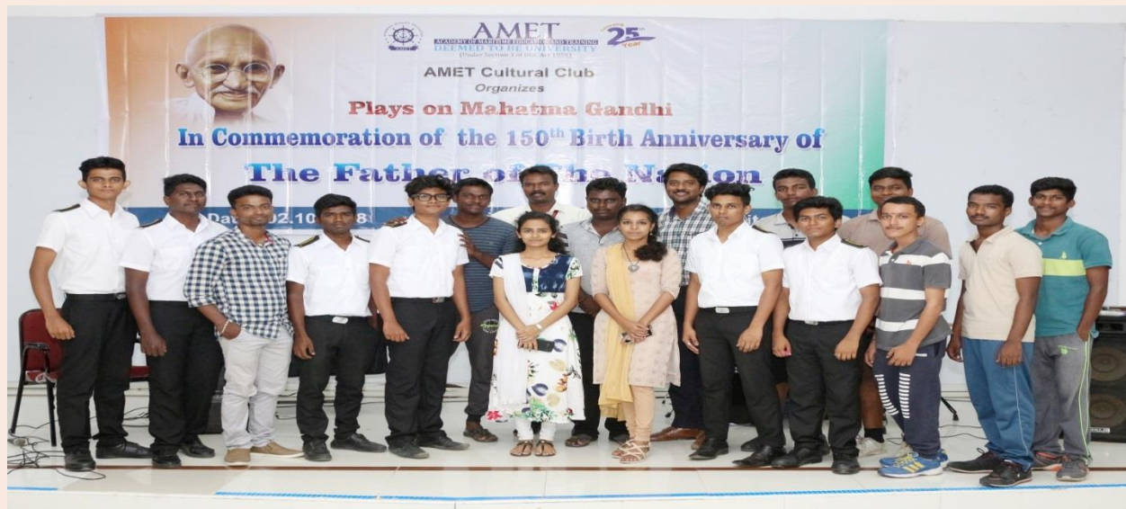
In Commemoration of the 150 th Birth Anniversary of Mahatma Gandhi