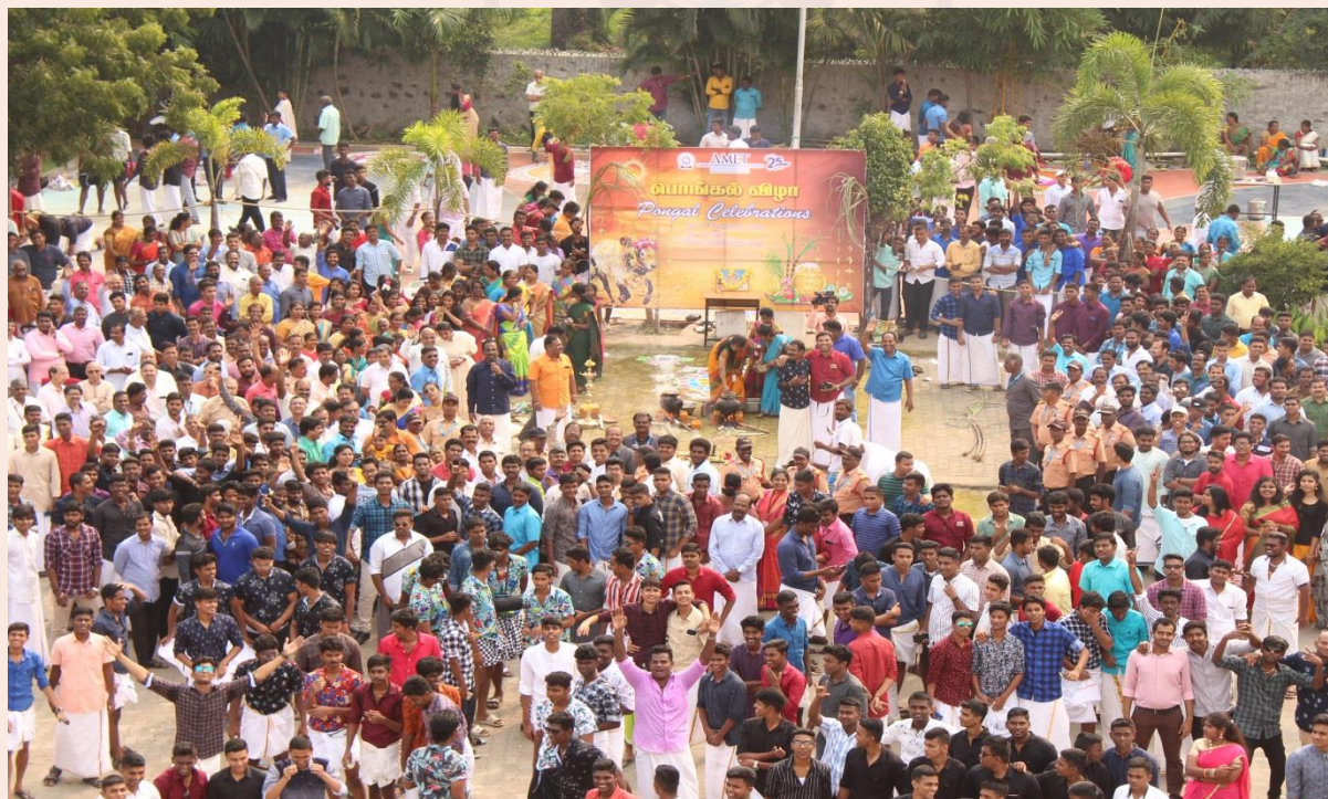
Pongal Celebrations – 14 th January 2020