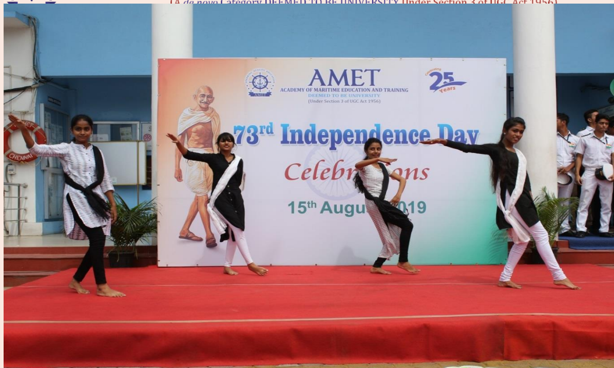
Independence Day Celebration 15 th August 2019 – Girls’ dance performance