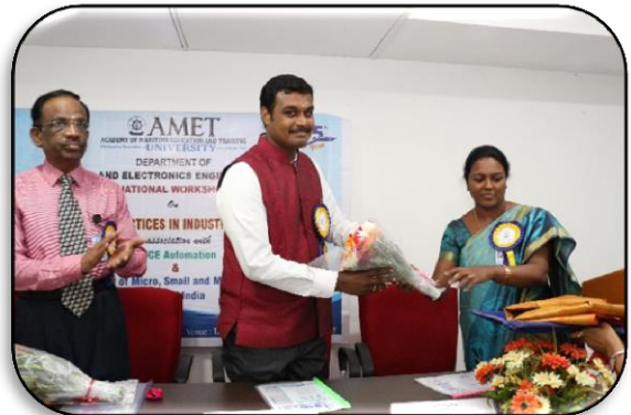
National Workshop on Conceptual Practices in industrial Automation in association with CDCE Automation & Ministry of Small, Micro and Medium Enterprises (MSME), Govt. of INDIA on 13 th and 14 th December 2017