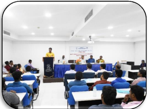
Two Days National Seminar on “Analysis of Transients in Power System using Electromagnetic Transient Program (EMTP-RV)” during 08.03.2018 & 9.3.2018