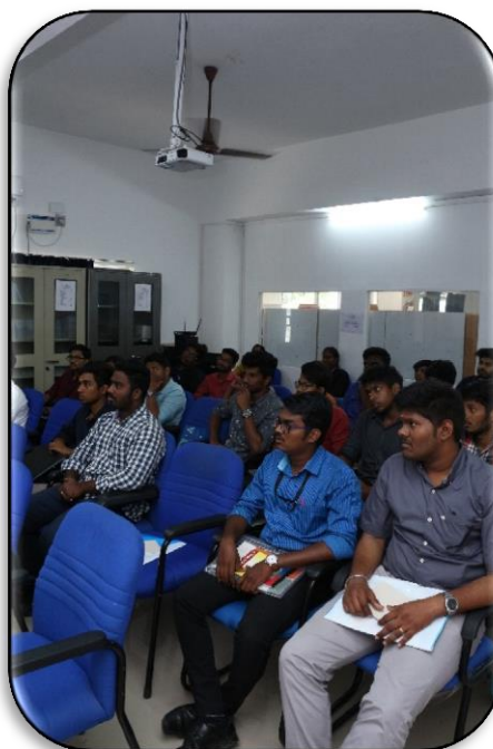
Two Days National Workshop on Ethical Hacking and Cyber Security in Association with Pristine Info solution Pvt, Ltd., Mumbai on 22.02.2019 & 23.02.2019