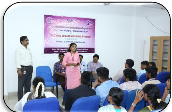
One Day Workshop on Machine Learning Using Python in Association with Signals & Systems India Pvt. Ltd on 22.3.2019