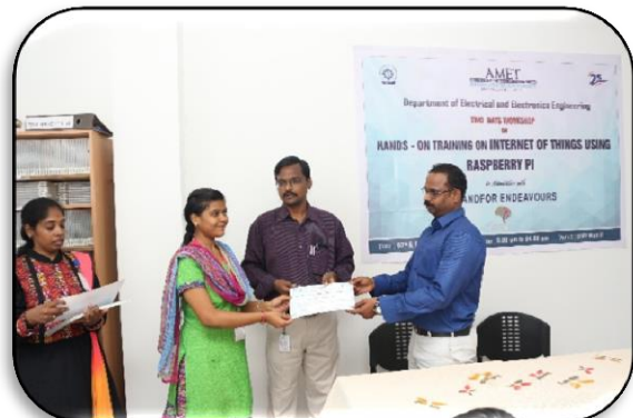
Two Days National Workshop on Internet of Things using Raspberry PI in association with IFANDFOR ENDEAVOURS on 7th and 8th September 2018