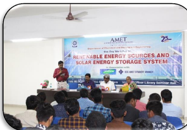
One Day Workshop on Renewable Energy Sources and Solar Energy Storage Systems in Association with Ensun Energy Systems Pvt. Ltd on 08.4.2019