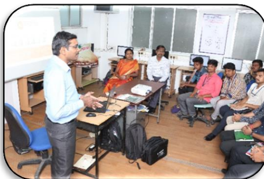
Two Days National Workshop on Simulation of Power System Transients in modern grids in Association with Powersys Solution on 30.01.2019 & 31.01.2019