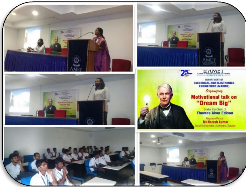
Motivational Talk on “Dream Big” conducted on 20 th Sep 2017