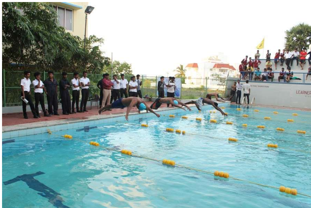
Training on Swimming (Life skills -Physical Fitness)