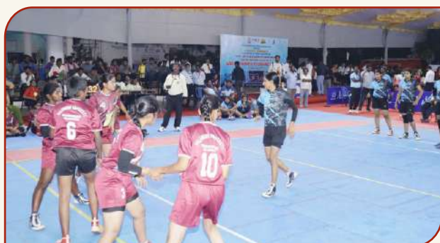
AIU - South Zone Inter University Kabbadi - Women Tournament 2022-23