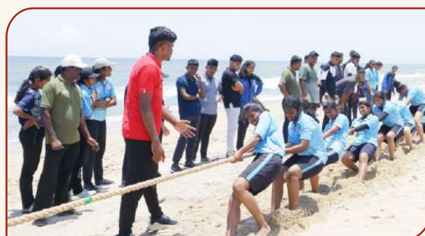
AIU - All India Inter Universities Tug of War - Women Tournament 2022-23