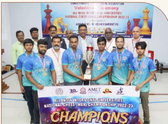
AIU - All India Inter Zonal Universities Chess - Men Tournament 2022-23