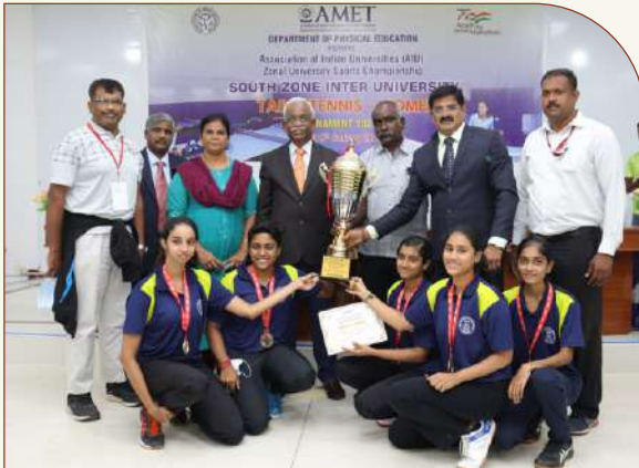
AIU - South Zone Inter University Table Tennis - Women Tournament 2021-22