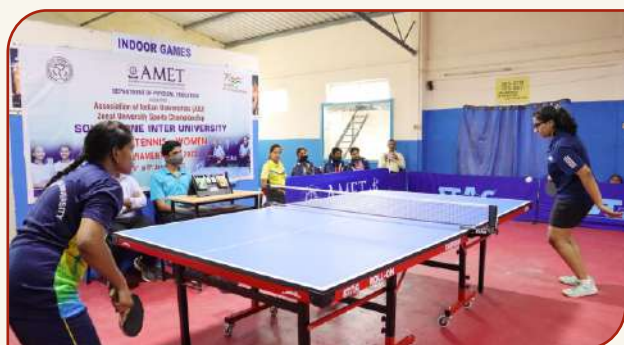
AIU - South Zone Inter University Table Tennis - Women Tournament 2021-22

Mobile No : 9381080111 E-Mail: hodped@ametuniv.ac.in