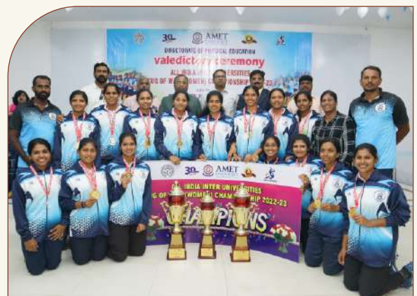
AIU - All India Inter Universities Tug of War - Women Tournament 2022-23