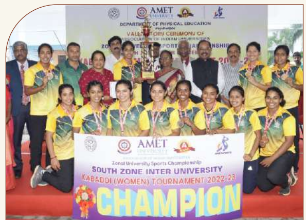
AIU - South Zone Inter University Kabbadi - Women Tournament 2022-23