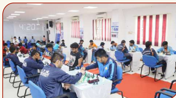
AIU - All India Inter Zonal Universities Chess - Men Tournament 2022-23