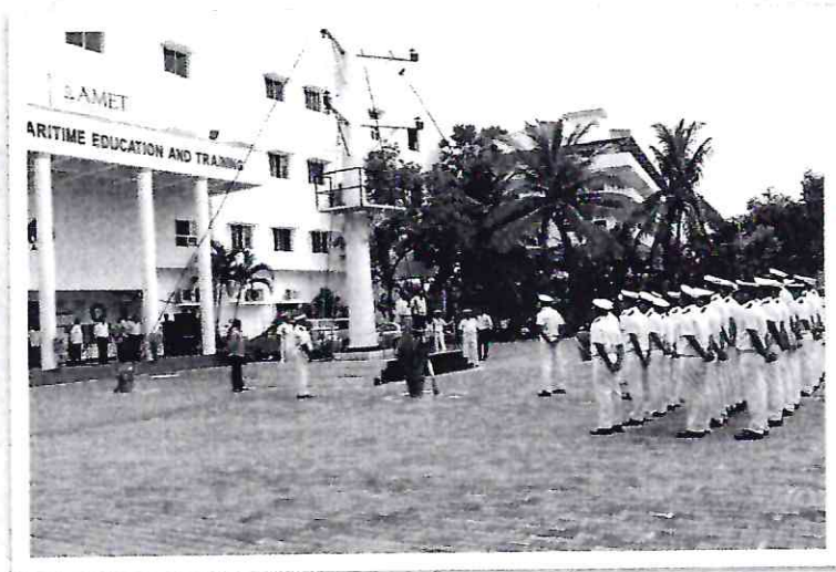
-CADETS LISTENING THE SPEECH