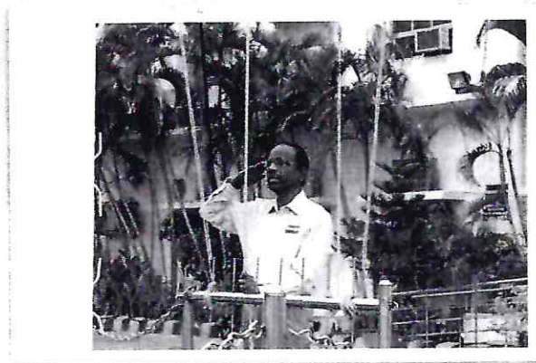
-Vice Chancellor Saluting the National Flag