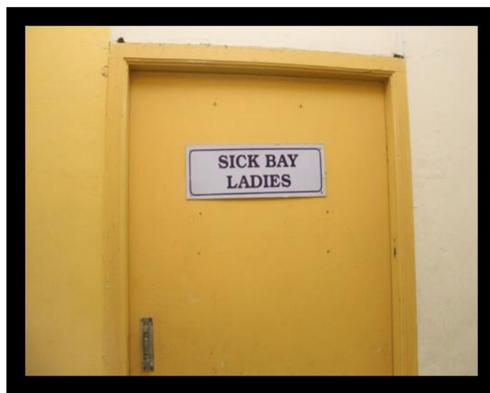
Sick bay for Girls